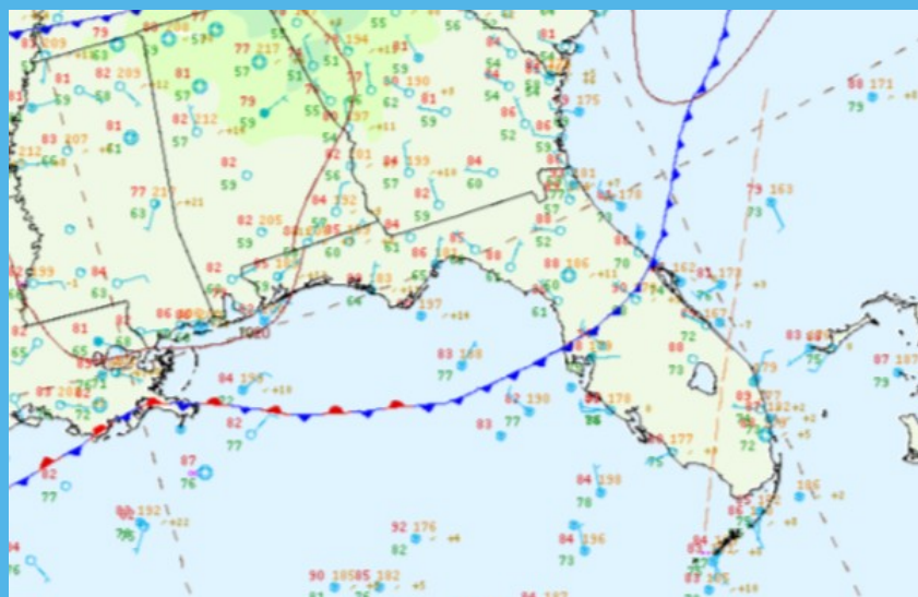
18Z May 29