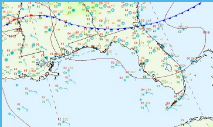
09Z May 31

In May, there were still cold fronts crossing into Florida.